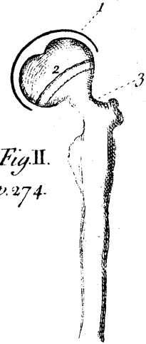
Fig. II. p. 274.